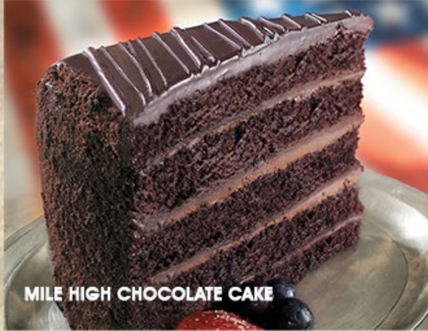
MILE HIGH CHOCOLATE CAKE