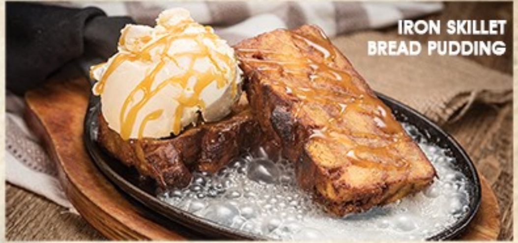
IRON SKILLET BREAD PUDDING

Thick-sliced and topped with vanilla-bean ice cream and caramel then served sizzling tableside with our Brandy Butter sauce.